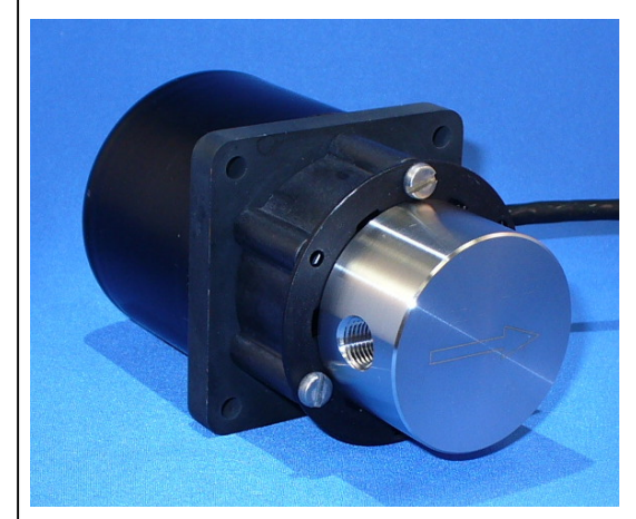
Pump shown with 1/8"-NPT side ports