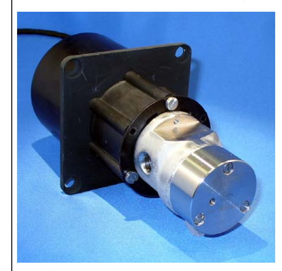
Pump shown with 1/8" NPT side ports and optional internal pressure relief valve.